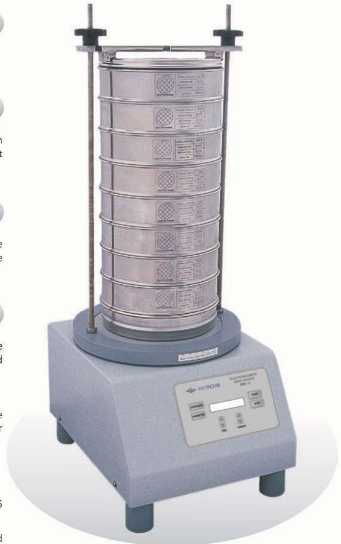
Electromagnetic Sieve Shaker