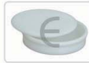
Lid & receiver for 100 mm dia test sieves Part no - 0501A00005