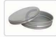
Lid & receiver for 200 mm dia test sieves Part no - 0501A00004