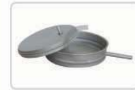
Wet sieve attachment for 200mm Dia Part no - 0501A00006