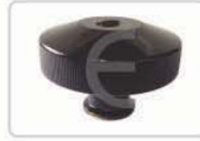
Backlight knob to fit locking arm (set of 2) Part no - 0501A00001